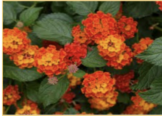
Texas Red Lantana