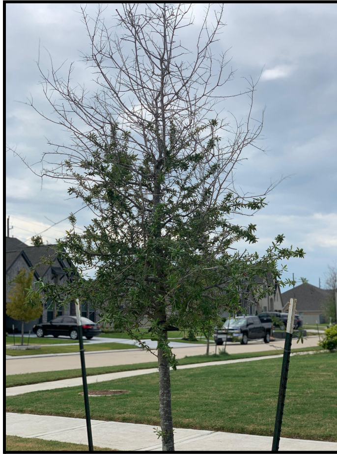
An example of dead wood that needs to be removed